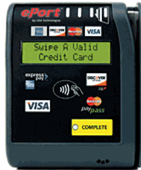
oti SATURN 6500 adapted to USAT ePort G9 solution

oti Customized the SATURN 6500 according to USAT requirements and supported USAT with the integration of the reader to their system and with its payment certification.